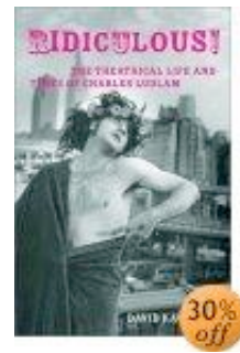
Ridiculous!The Theatrical Life & Times of Charles Ludlam